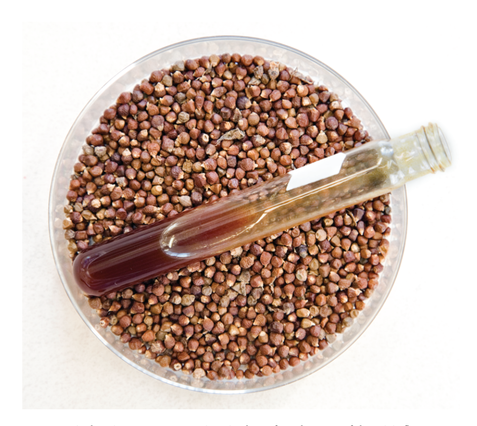
Biochemists at Rutgers University have found a powerful anti-inflammatory compound in the seeds of the African wetland plant Aframomum melegueta, or grains of paradise. The compound, named "006," has been licensed by Rutgers to Phytomedics, a New Jersey pharmaceutical company, for possible drug development. Phytomedics in turn licensed cosmetics rights to Avon Products, which will release an 006-containing skin-care line this spring.

According to a 1997 survey Dierenfeld conducted, gorillas' diets varied considerably from zoo to zoo, with more than 115 food items on the menu. Twenty different vegetables were offered on a regular basis in the survey's 37 zoos. Then there were 23 fruits, including apples, bananas, oranges, raisins, and tomatoes. "But cultivated fruits are usually lower in fiber and higher in moisture and simple sugars than native fruits eaten by gorillas