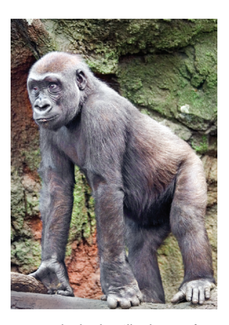
Western lowland gorilla Shana, a fouryear-old male, was born in the Bronx Zoo's Congo Gorilla Forest. Shana and other gorillas in zoos in North America are cared for under the Species Survival Plan (SSP) for gorillas, a program to manage the population of captive western lowland gorillas. SSPs for threatened and endangered species were initiated by the American Zoo and Aquarium Association in 1982. Most of the more than 370 gorillas currently living in North American zoos were born in 55 SSP-participating zoos.

If it's up to the Bronx Zoo, they will. The zoo is home to 22 western lowland gorillas, 16 females and 6 males, in a habitat called Congo Gorilla Forest. Zuri, a 23-year-old silverback gorilla, leads one of two gorilla troupes. Sharing the ropy vines in his enclosure is Holli, a 17-year-